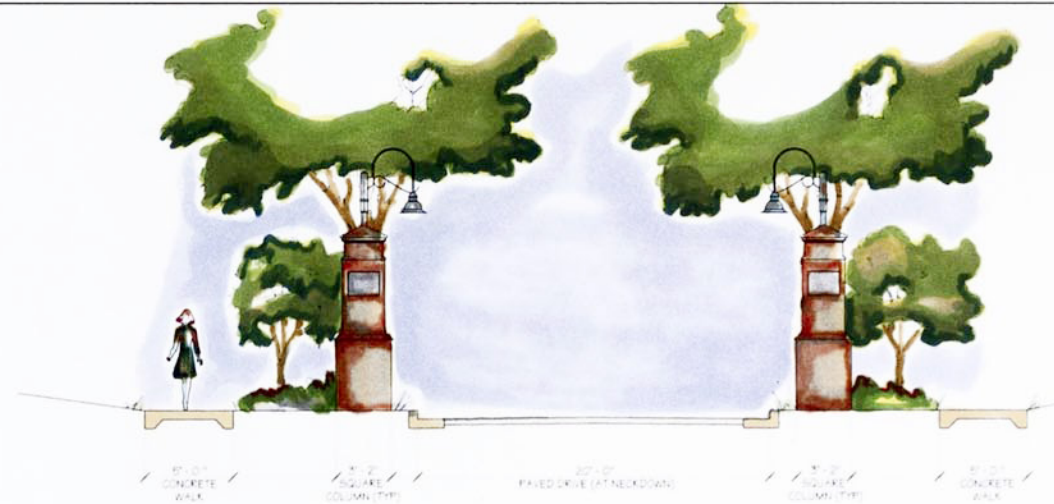
SECTION - TYPICAL ENTRANCE TREATMENT